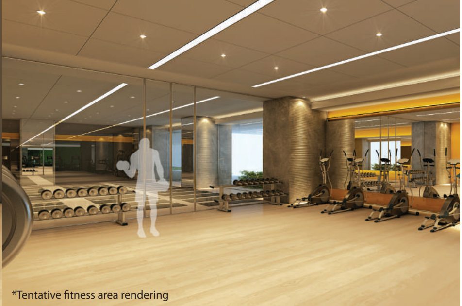
*Tentative fitness area rendering