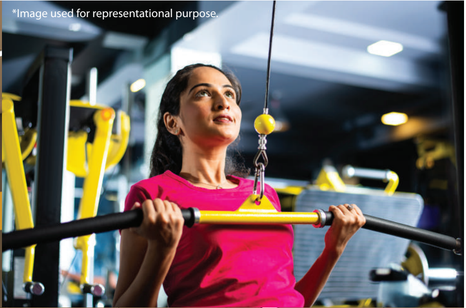
*Image used for representational purpose.